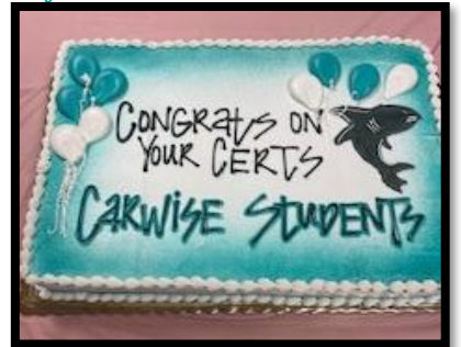
Quarterly Drawings for Prizes!

Quarterly Cake Parties for certifications!