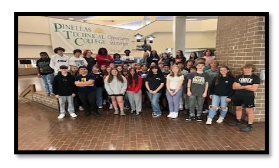
Guest Speakers from the Business Community!